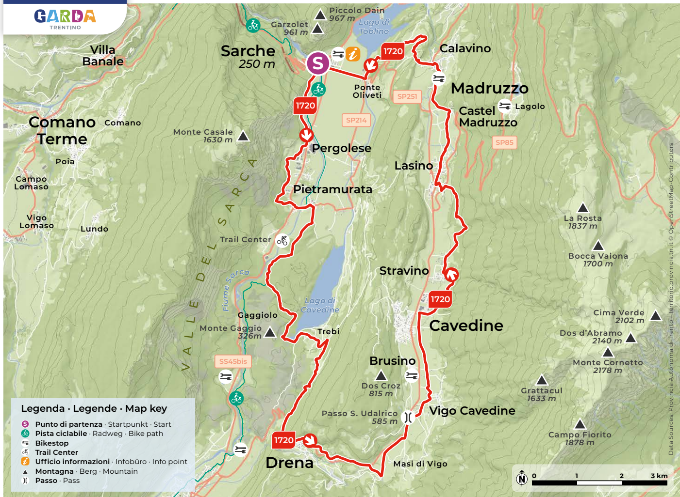
Design and cartography 2024 | max2.at