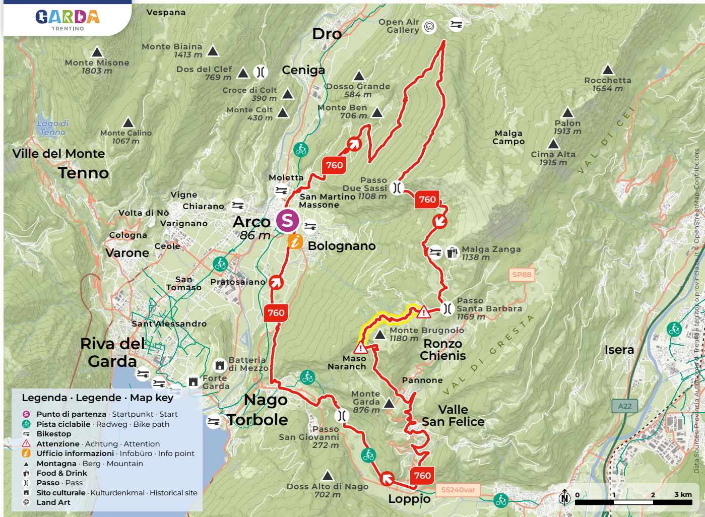
Design and cartography 2023 | max2.at