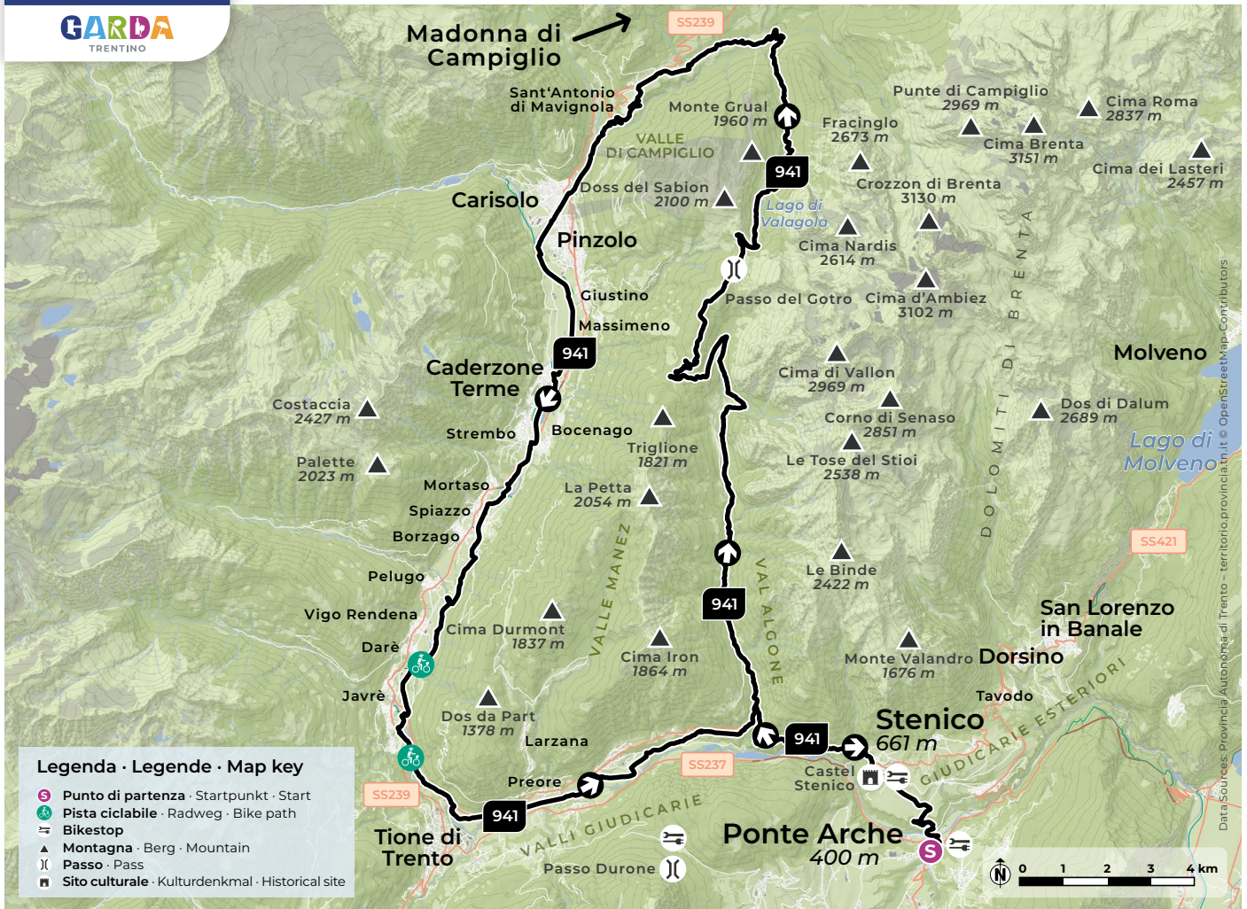
Design and cartography 2023 | max2.at