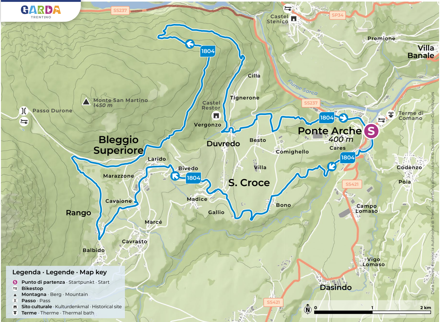
Design and cartography 2023 | max2.at